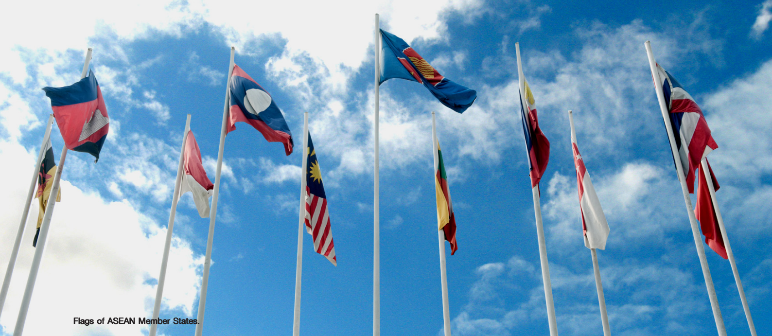
Flags of ASEAN Member States.

Partnerships to Finance ASEAN Connectivity” would be held in Nay Pyi Taw, Myanmar in September 2014.