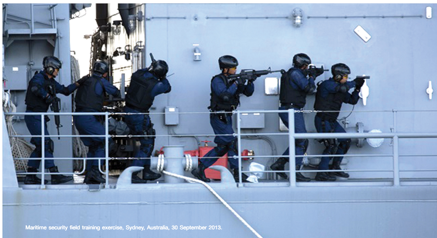
Maritime security field training exercise, Sydney, Australia, 30 September 2013.

The ASEAN Peacekeeping Centres Network, in its second meeting in September 2013 agreed to continue implementing its short, medium, and long-term work plan through seminars and workshops. The Terms of Reference of the ASEAN Defence Industry Collaboration