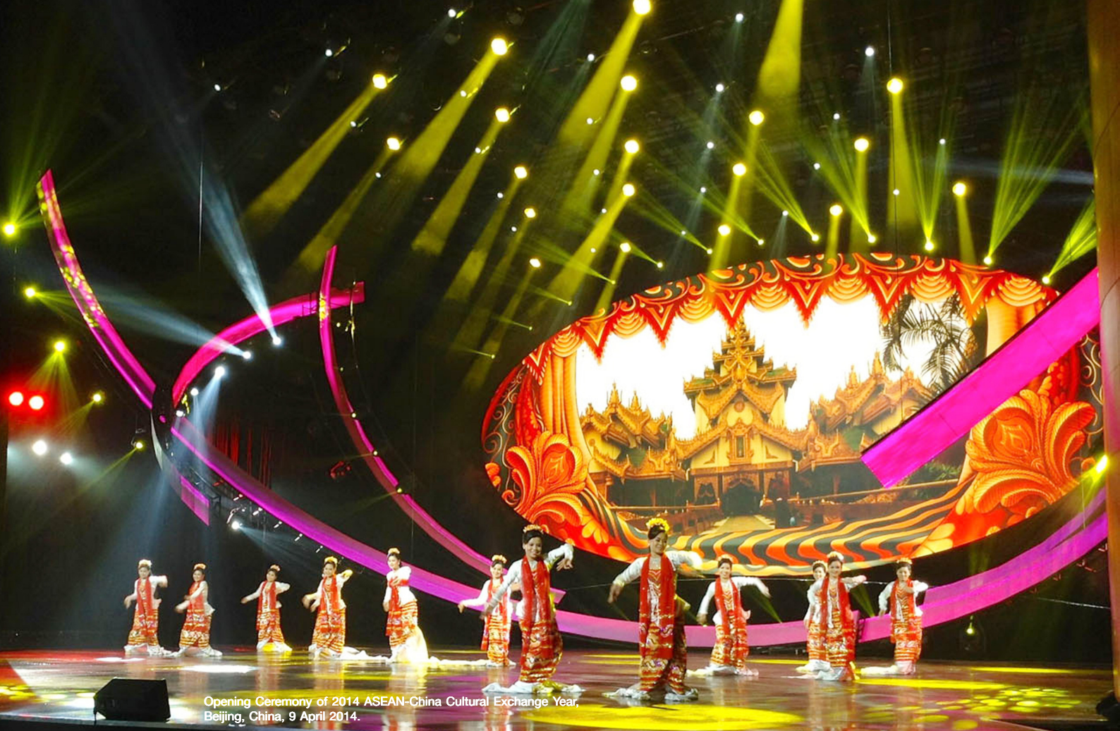
Opening Ceremony of 2014 ASEAN-China Cultural Exchange Year, Beijing, China, 9 April 2014.

for 2014, and in consultation with key stakeholders, has identified a number of priority areas which it hopes to address this year and highlighted several potential deliverables for the consideration of the 2015 ASEAN Summits. The ASCC is ready to be counted to play a significant role in the ASEAN Post-2015 visioning exercise through the ASEAN Coordinating Council Working Group (ACCWG).