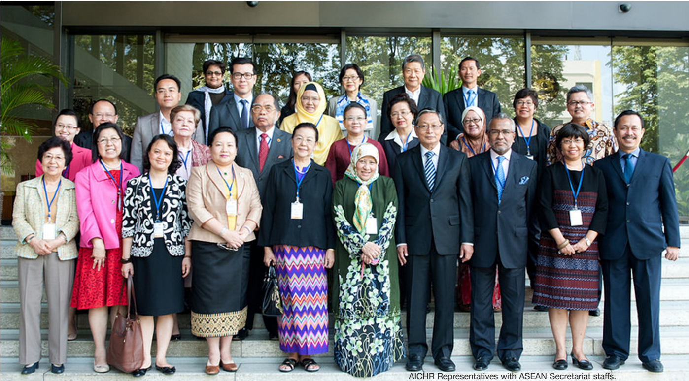
AICHR Representatives with ASEAN Secretariat staffs.