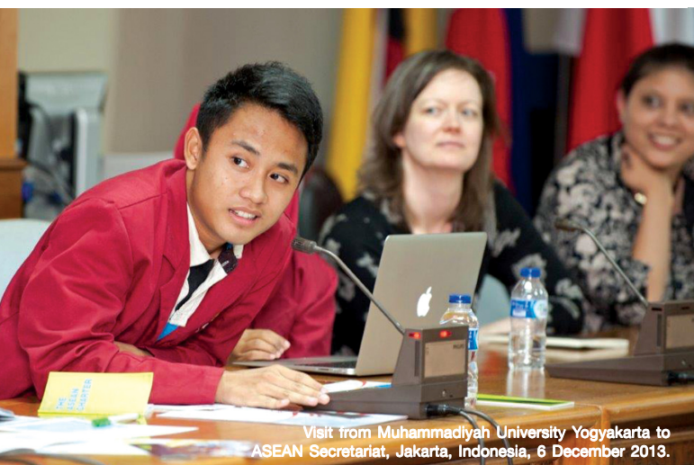
Visit from Muhammadiyah University Yogyakarta to ASEAN Secretariat, Jakarta, Indonesia, 6 December 2013.

ASEAN's work. It will continue to assist in building capacity of the Member States to enable more effective conveyance of ASEAN Community's messages. These efforts are envisaged to deepen understanding about ASEAN and hopefully increase solidarity among its peoples.