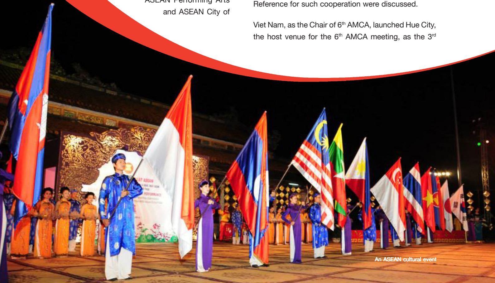
An ASEAN cultural event

Viet Nam, as the Chair of 6 th AMCA, launched Hue City, the host venue for the 6 th AMCA meeting, as the 3 rd