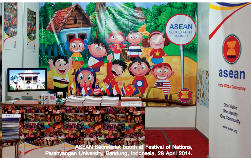
ASEAN Secretariat booth at Festival of Nations, Parahyangan University, Bandung, Indonesia, 28 April 2014.