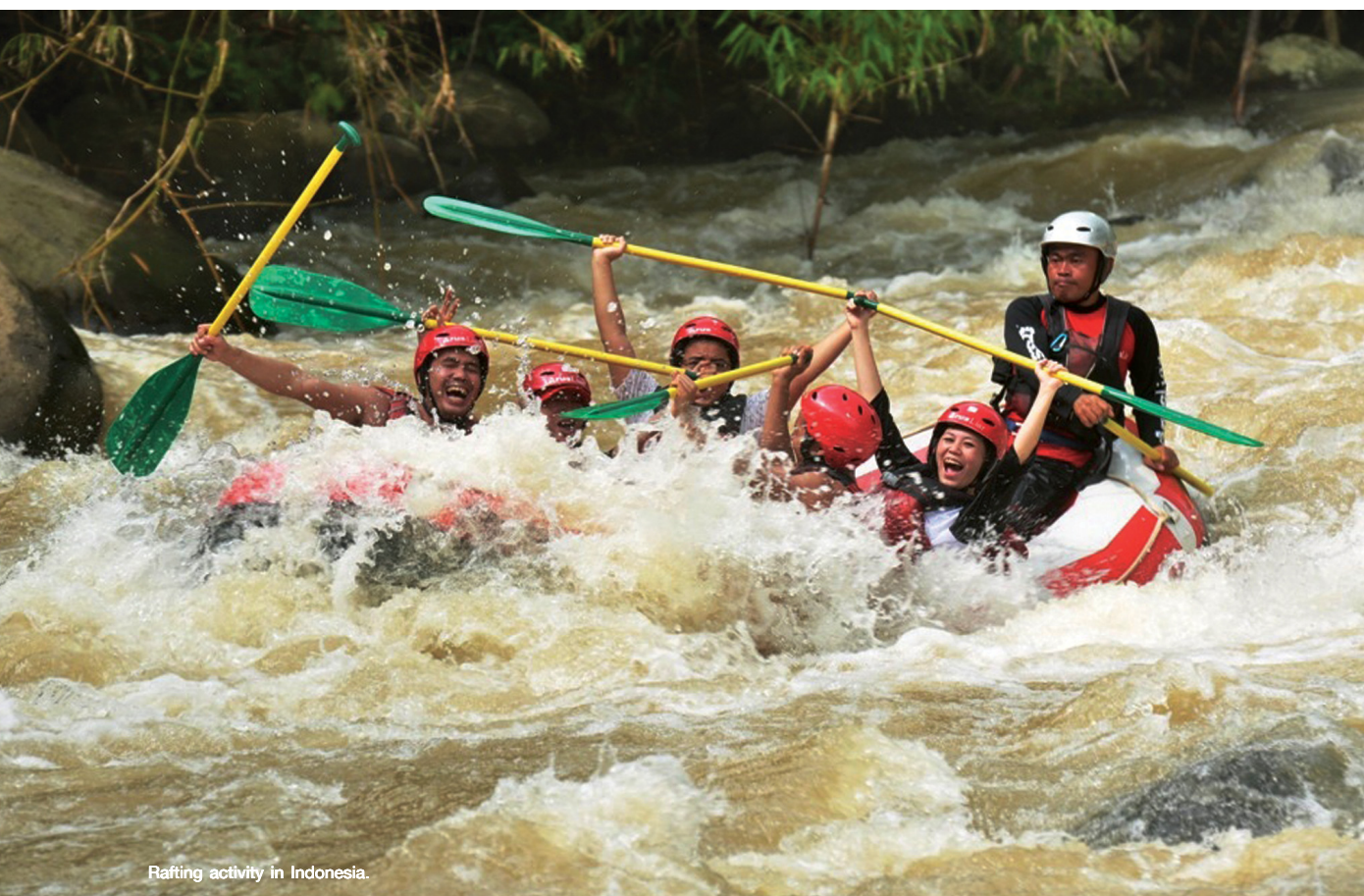
Rafting activity in Indonesia.

2013 saw the launch of the ASEAN Sports Industry Year (ASIY) and all ASEAN Member States conducted sports-related activities with the involvement of relevant industries in their respective countries. There was a recognition that ASEAN needs to be collectively engaged in promoting the sports agenda, considering the increased demands across the different aspects, including athletes' development and sports infrastructure. The celebration of the ASIY 2013 was noted by the 10 th Meeting of ASEAN Socio-Cultural Community (ASCC) Council held on 4 April in Nay Pyi Taw, Myanmar.