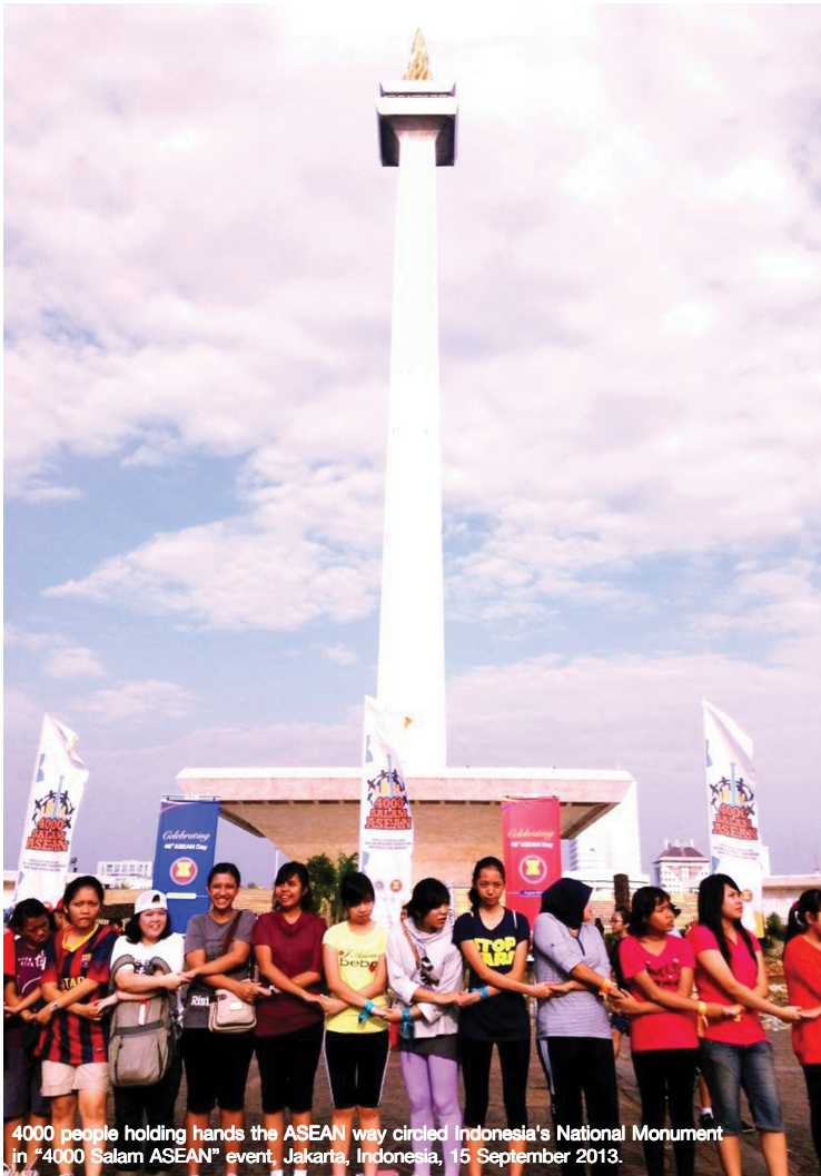
4000 people holding hands the ASEAN way circled Indonesia's National Monument in "4000 Salam ASEAN" event, Jakarta, Indonesia, 15 September 2013.

The publications covered topics on political-security, economic, and socio-cultural cooperation, as well as general and short information on ASEAN. Dissemination of the publications reached several group of people – government officials, students, academe, researchers, business, think-tanks, libraries in ASEAN Member States, ASEAN Committee in Third Countries, and other institutions. Beside the printed format, the publications also appeared in the ASEAN website and promoted in social media to reach larger groups of audience.