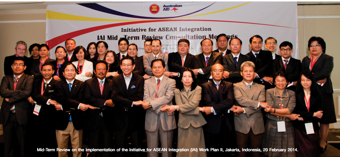
Mid-Term Review on the Implementation of the Initiative for ASEAN Integration (IAI) Work Plan II, Jakarta, Indonesia, 20 February 2014.

A mid-term review (MTR) of the IAI Work Plan II was conducted to analyse the achievements to-date, set out practical measures to effectively implement the remaining Work Plan II and chart IAI’s future direction. The IAI Task Force’s assessment and recommendations based on the MTR report will be presented to the ASEAN Coordinating Council at the end of 2014.