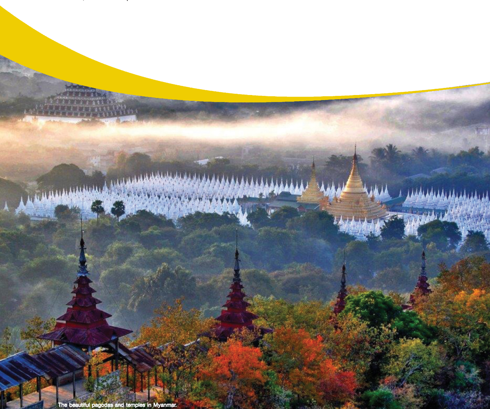
The beautiful pagodas and temples in Myanmar.

The ASEAN Tourism Forum (ATF) 2014 held on 16-23 January 2014 in Kuching, Malaysia, with the theme of "ASEAN: Advancing Tourism Together" was attended by 462 international buyers and 879 sellers with 353 booths as well as 75 media.