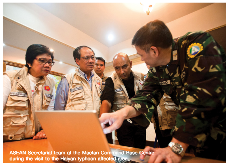
ASEAN Secretariat team at the Mactan Command Base Centre during the visit to the Haiyan typhoon affected area.

Aside from its work at the regional level, ASEAN is also actively involved in shaping the global discussions on disaster risk reduction, specifically in contributing to the discussion on the development of the successor framework for Hyogo Framework Action (HFA) or HFA-2, which is expected to be adopted at the Third United Nations World Conference on DRR in March 2015 in Japan.