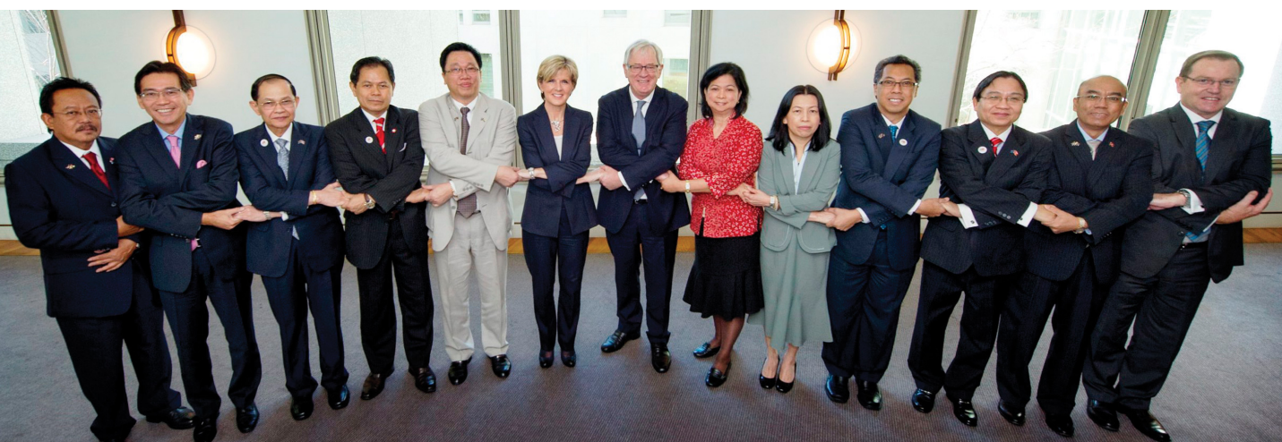
The ASEAN Committee of Permanent Representatives (CPR) visited Australia on 27 May to 1 June 2014 as part of the commemorative activities for the 40 th anniversary of ASEAN-Australia relations.