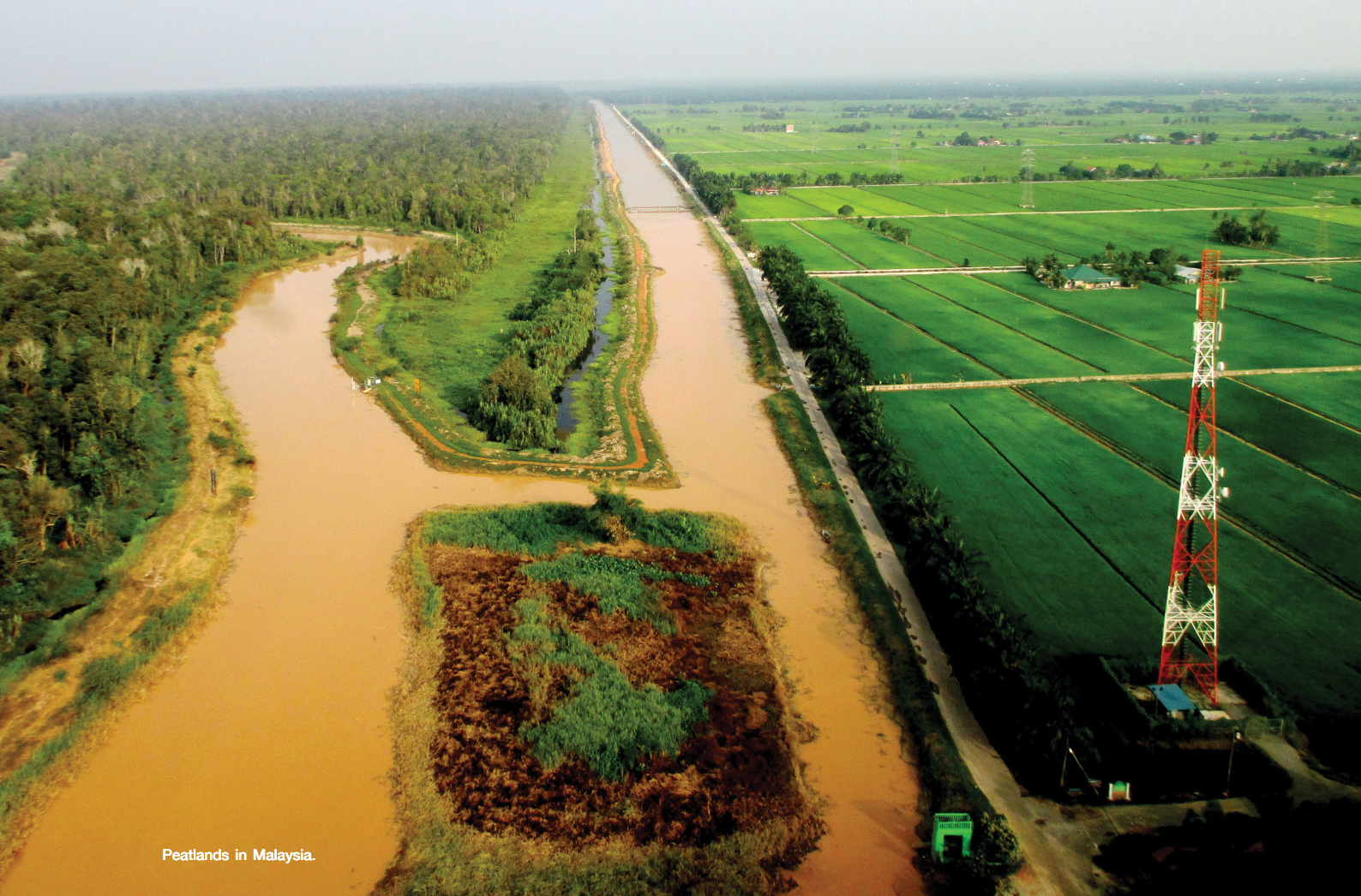
Peatlands in Malaysia.