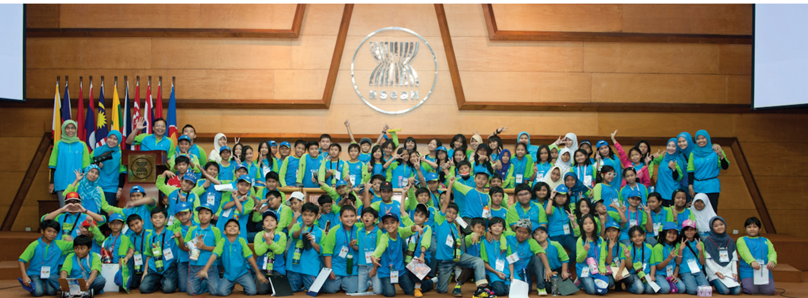
Students of Budi Mulia Elementary School of Jakarta during their visit to the ASEAN Secretariat, 15 November 2013.

As ASEAN draws closer to formal integration in 2015, ASEAN Secretariat will step up its outreach activities in line with the promise of a more people-oriented and people-centered ASEAN Community. With guidance from the ASEAN Communication Master Plan, the Secretariat will aim to narrow the gap between high awareness of ASEAN and low understanding of