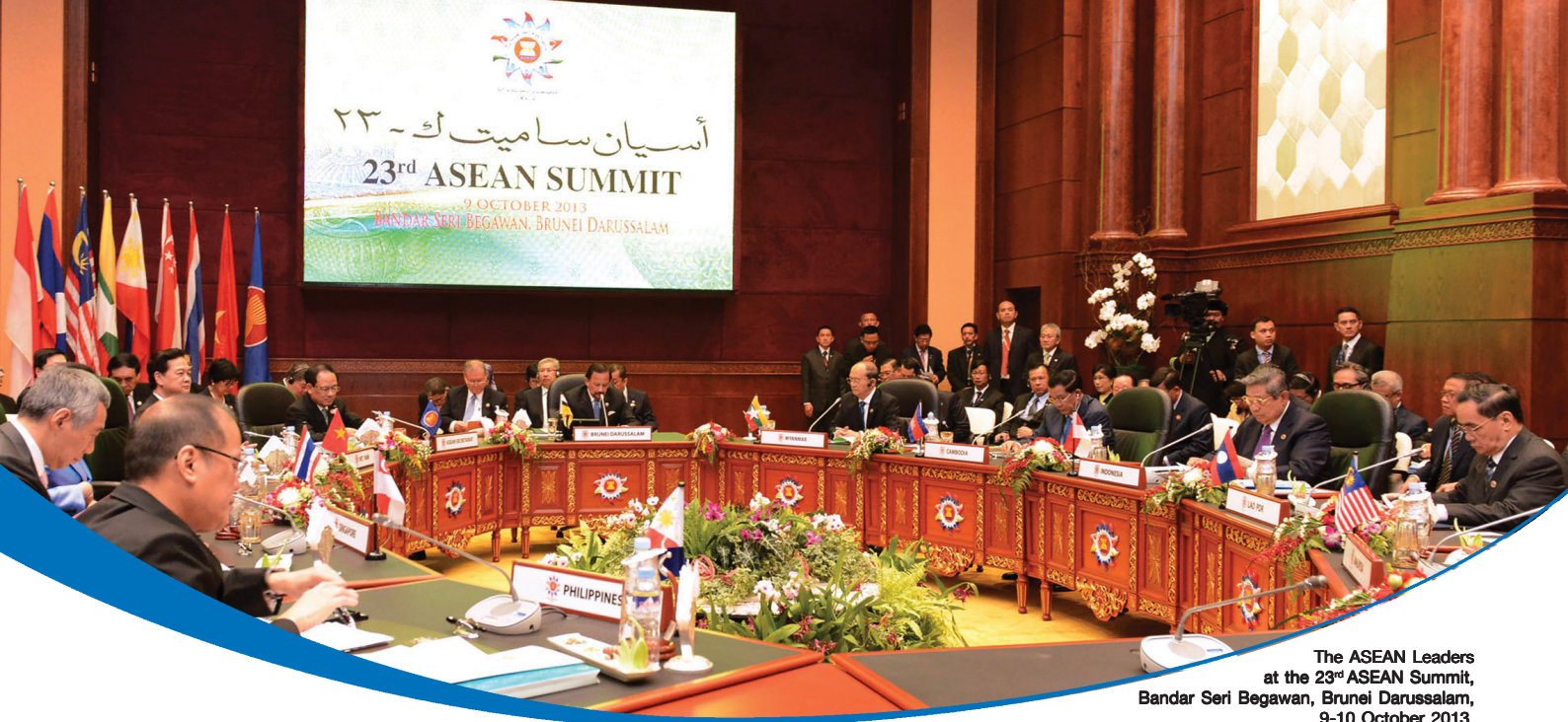
The ASEAN Leaders at the 23 rd ASEAN Summit, Bandar Seri Begawan, Brunei Darussalam, 9-10 October 2013.